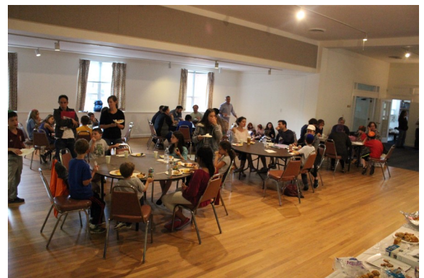
Photos of the Last day of Talmud Torah and Siyyum