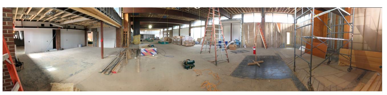
Panorama of the Sanctuary Under Construction Next time you see the sanctuary it will look very different!

Stay up to date with upcoming Beth El events at http://www.betheldurham.org/calendar/