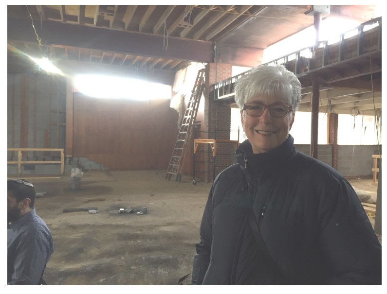
Note: The original stained glass windows will be re-purposed and re-used in the new building.

Now, I'm excited about the continuing evolution of our building, look forward to attending services in our beautiful new sanctuary and celebrating more important functions there. We've come a long way, baby!