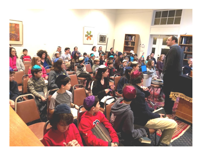
Learning at Talmud Torah!