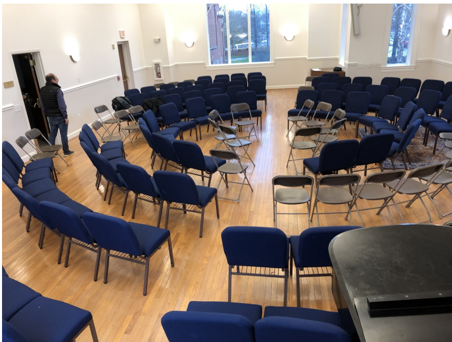
Set up for the Friday night service with the River Church, February 2019