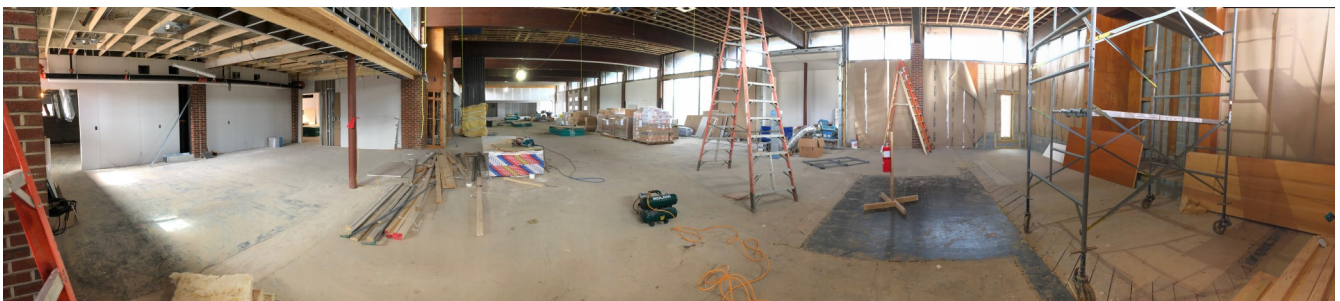
Panorama of the Sanctuary Under Construction Next time you see the sanctuary it will look very different!

Stay up to date with upcoming Beth El events at http://www.betheldurham.org/calendar/