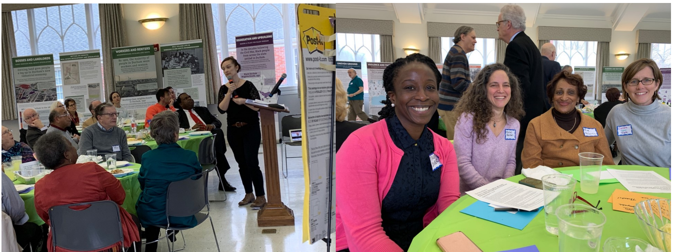
Above: The History of Durham's Housing Inequality: Interfaith Lunch and Learn TAPC, February 24, 2019