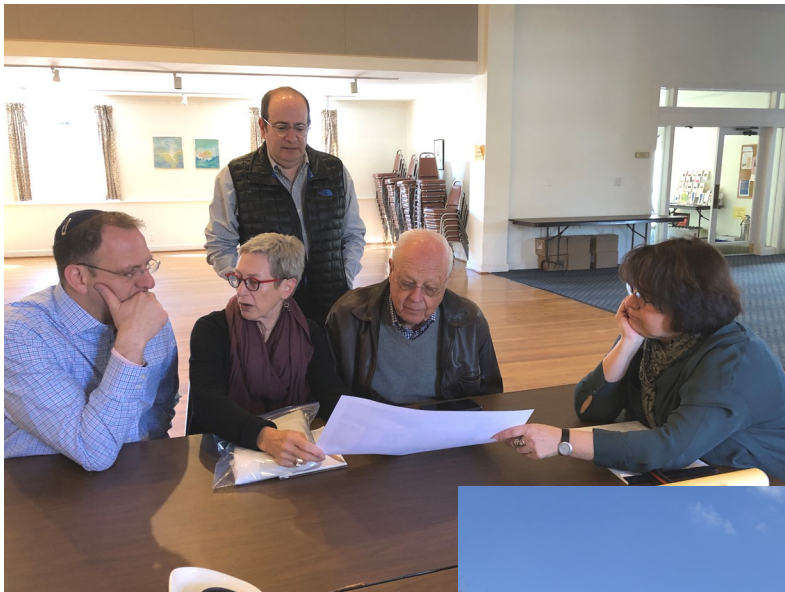
Left: Reviewing the architectural drawings of the new building