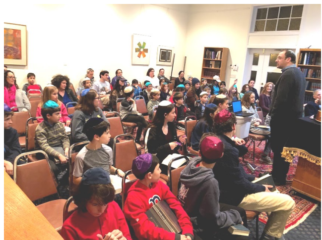
Learning at Talmud Torah!